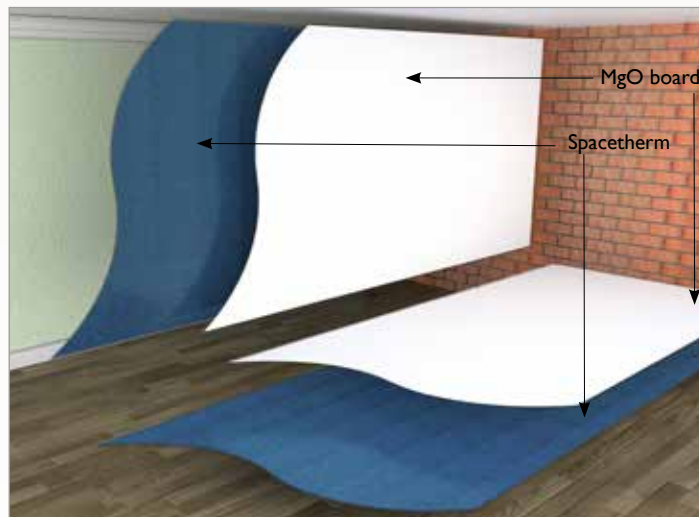
Image showing Spacetherm Multi applied internally to an existing external wall structure.

Where an internal partition abuts an external wall with Spacetherm Multi lining, ideally Spacetherm Multi should be returned onto the partition or alternatively stopped at the junction.