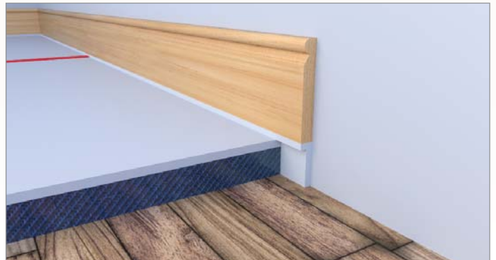
Fig 1 - Spacetherm Multi skirting detail