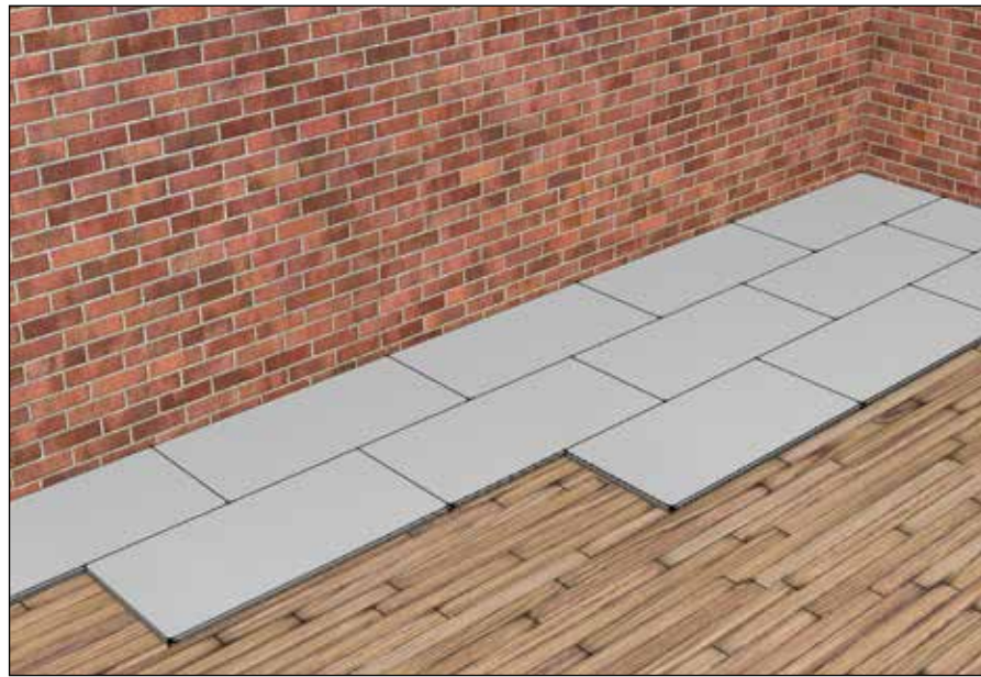
Fig. 4 Board installation pattern for Spacetherm Multi

Spacetherm Multi panels are loose-laid. Mechanical fixings must not be used to fix flooring panels to the underlying subfloor. Use Wraptite Tape to seal butt joints to control dust movement between adjacent panels. Optionally, Wraptite Tape may be used to seal the floor perimeter expansion strip. Surfaces to be taped should be as clean and dust-free as possible.