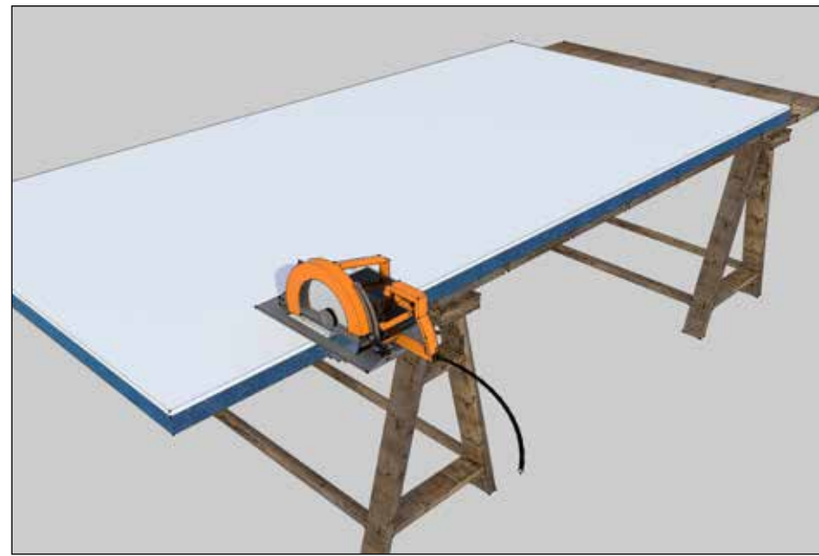
Fig. 2 Cutting Spacetherm Multi Boards

Mechanical cutting is best done with a jigsaw or circular saw, whichever is most appropriate for the type of cut. Before cutting, ensure the board is adequately supported, and cuts should always be made from the internal face of the board (e.g. MgO side).