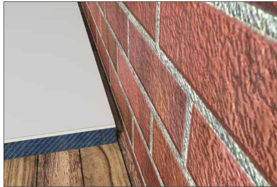
Fig. 6 Expansion gap at perimeter of Spacetherm Multi

Allow for an expansion strip around the perimeter between Spacetherm Multi and the wall or other abutments. The rate of expansion or contraction will depend on the moisture content of the boards, the laying conditions and the length of run. If required, small wedges can be placed between the Spacetherm Multi boards or wall.