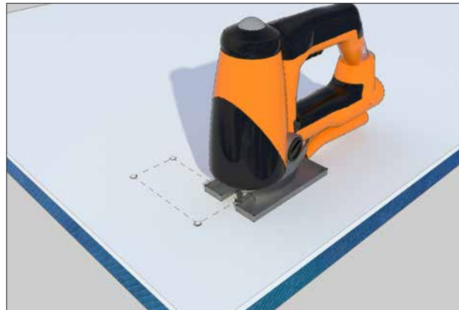
Fig. 3 Making cut-outs in Spacetherm Multi

Cut outs required for pipework or other penetrations, if required, can be made by carefully measuring the location, then drilling the corners and cutting out with a jigsaw in the normal manner.