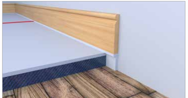
Fig 1 - Spacetherm Multi skirting detail