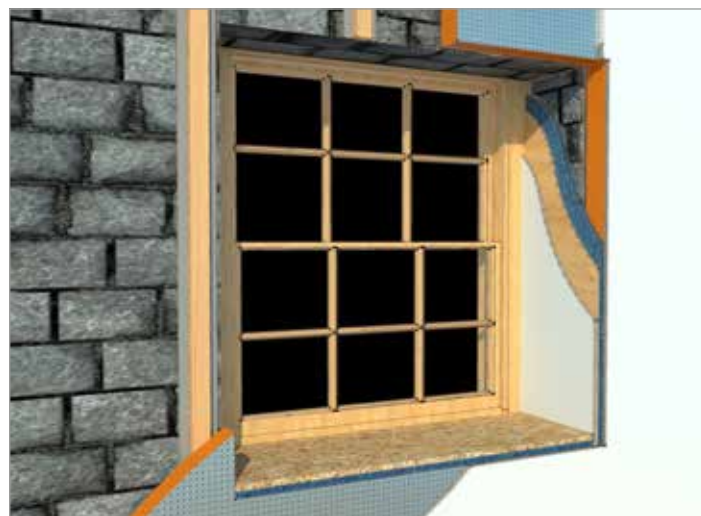
Image showing Spacetherm WRB applied internally to a reveal on an existing external wall structure.