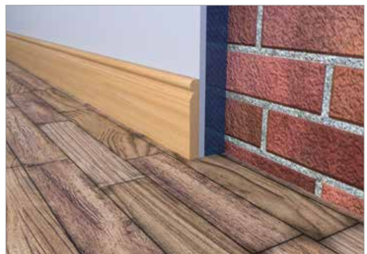
Spacetherm Wallboard skirting detail

For other thicknesses, or for U-value calculations for your project, please contact Technical Services on 01250 872261 or technical@proctorgroup.com