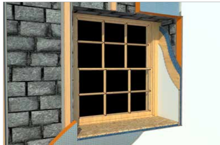
Image showing Spacetherm WRB applied internally to a reveal on an existing external wall structure.